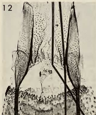
Figs. 11-13. Female genitalia of Scrobipalpa reiprichi Pov. Figs. 11-12. Norway, slide no. OK 4239. Fig. 13. Paratype, Czechoslovakia, slide POVOLNÝ (without number).